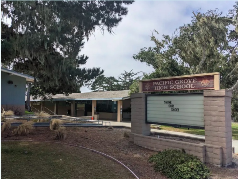
Pacific Grove Unified School District

"Pacific Grove Unified partners with local partners to crack down on racism" by the Monterey Herald