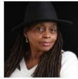
Ayodele Nzinga Oakland Poet Laureate